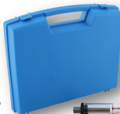
Material study kit