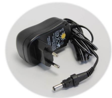
Included power supply

Black aluminium casing with hexagonal shape Aluminium rod \varnothing 10 removable Lighting source: LED 3W Condenser: 2 lenses \varnothing 40 F+100 Ventilated Power supply: 6V (included) Longitudinal adjustment rod Weight: 330 g Dimensions with rod: 225 x 95 x 220 mm Packaging: individual box.