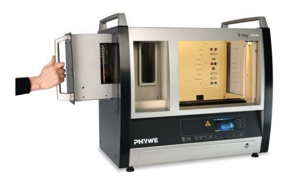
Fig. 6: X-ray plug-in unit on the left-hand side of the unit

Plug-in unit for holding the adjusted X-ray tube in a sheet steel housing with a carrying handle, ready for use in the X-ray XR 4.0 X-ray expert unit. The housing of the tube has a catch lock and two safety contact pins that enable the tube operation only if the plug-in unit has been installed correctly.