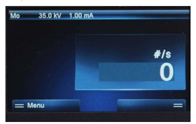
Fig. 10: Screen for controlling the unit at the front of the unit. The x-radiation is not activated.

The unit has four device statuses that are listed in Table 2. Depending on the status, the unit can be controlled entirely via the buttons on the control panel together with the graphical representation.