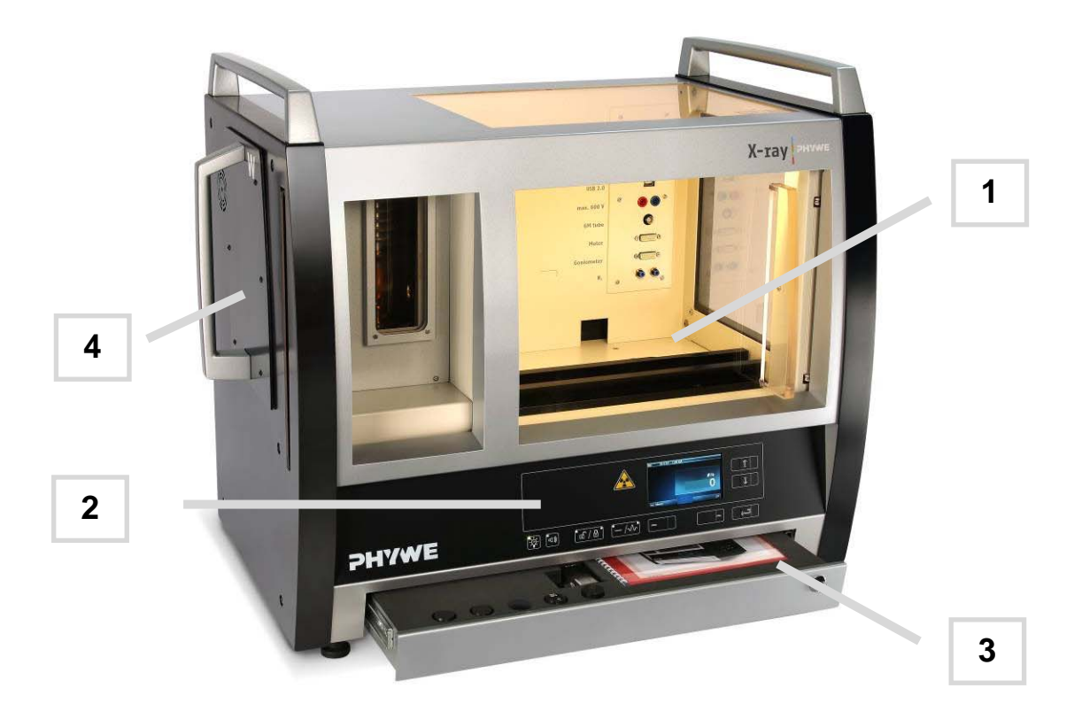
Fig. 2: Front view of the XR 4.0 X-ray expert unit (09057-99) including X-ray tube