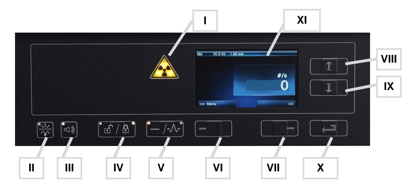
Fig. 5: Control panel at the front of the unit