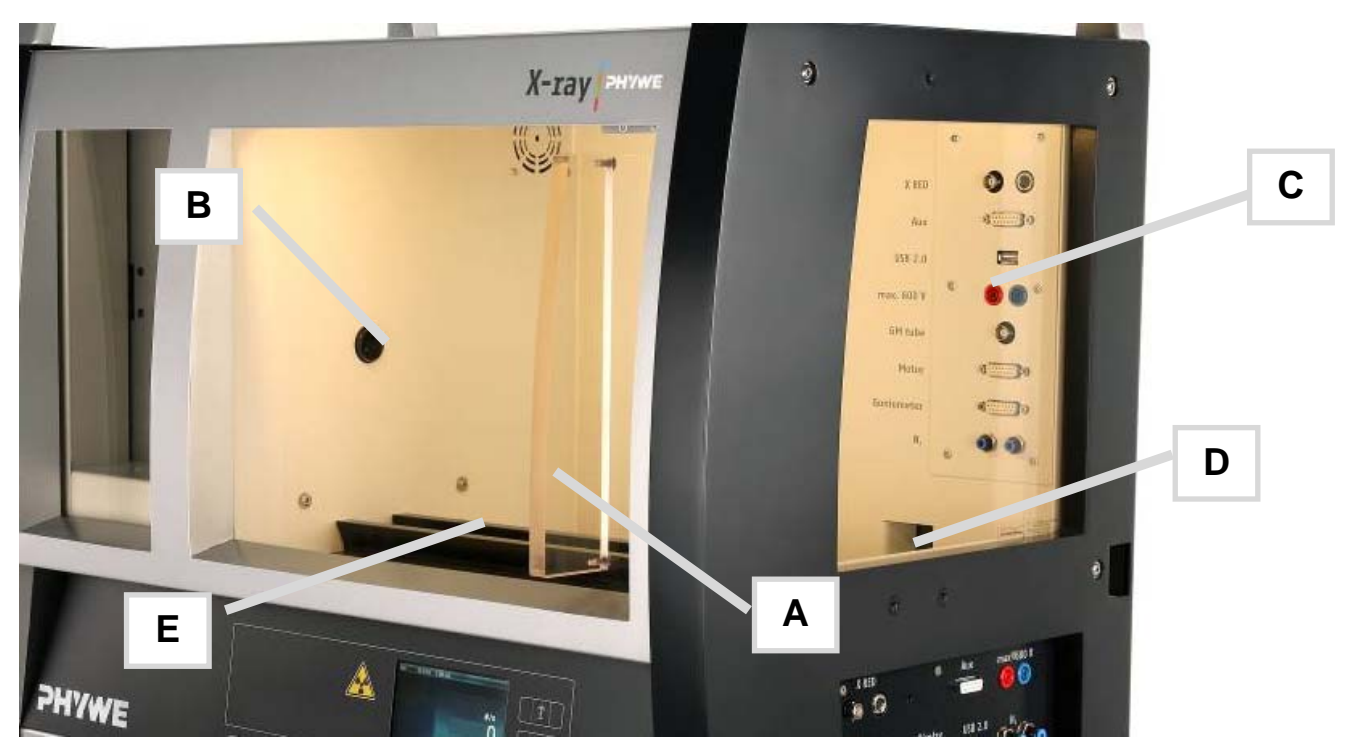
Fig. 4: experimentation chamber