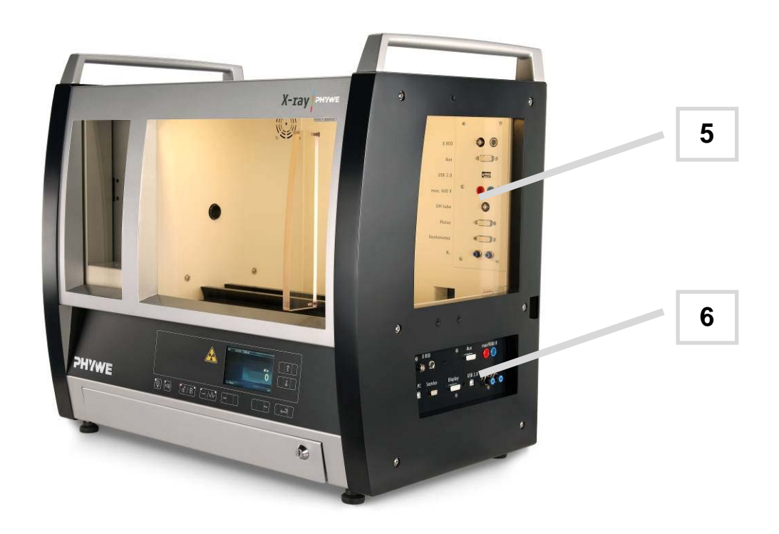
Fig. 3: View from the right side XR 4.0 X-ray expert unit (09057-99)