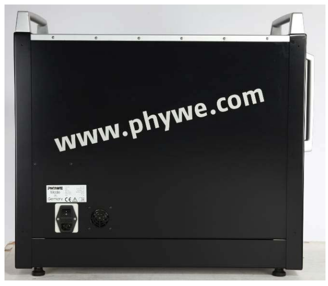
Fig. 9: Back of the unit with the socket for the power cable and the central ON/OFF switch

Connect the unit to the power supply via the supplied power cable with an IEC connector. The socket for this purpose is located at the back of the unit (see Fig. 9).