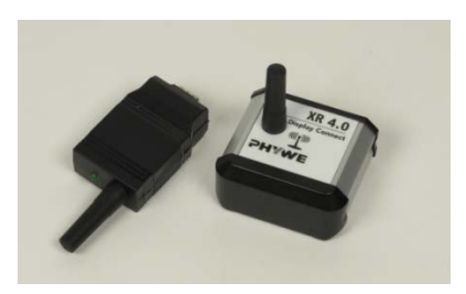
Fig. 13: XR 4.0 Display Connect module

09057-19 XR 4.0 Display-Connect, set of transmitter and receiver