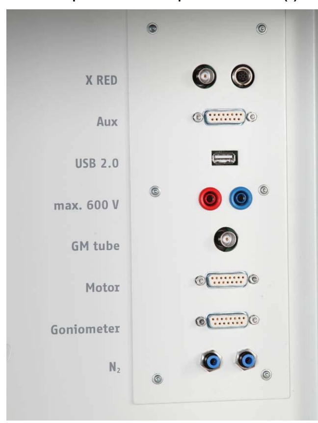
Fig. 7: Socket panel inside the experiment chamber

The socket panel at the back wall of the experiment chamber (Fig. 7) includes the following sockets for the connection of components in the experiment chamber. The names that are stated inside the unit are printed in italics.