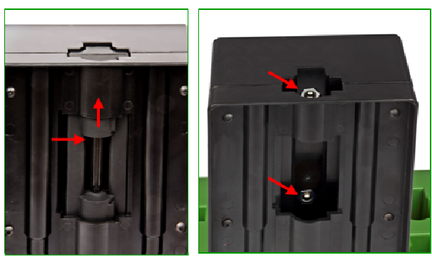
Removing a tube

Note: For some tubes the discharge may not strike immediately after turning on the power supply if the tube has not been operated for an extended period. It may take up to 3 minutes for the discharge to strike for the first time. This is normal. The discharge will then strike immediately.