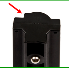
End of tube -back view